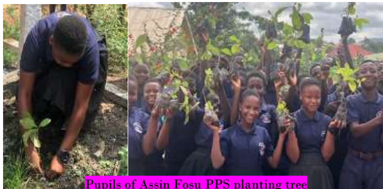
Pupils of Assin Fosu PPS planting tree

The picture shows a section of students from the Pentecost Preparatory School Assin Fosu planting trees to commemorate the occasion.