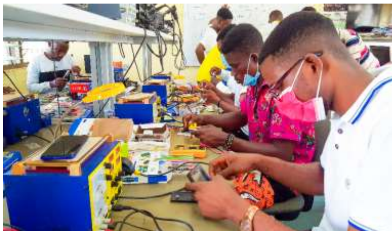
A section of youth been trained in mobile phone repairs and assembling

The Pentecost Social Services (PENTSOS) in partnership with the National Entrepreneurship and Innovation Programme (NEIP), has trained and resourced with start-up kits to youth in the Church of Pentecost in the following fields: fashion, cosmetology, beekeeping and honey production, mobile phone repairs and assembling, cake making and decoration and catering. The training was funded by the Government of Ghana under the Ghana Skills and Enterprise Development Project with an overarching purpose to build the productive capacity of the Youth by creating immediate and direct employment opportunities through artisanal skills training and business development services.