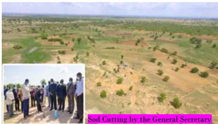
Sod Cutting by the General Secretary