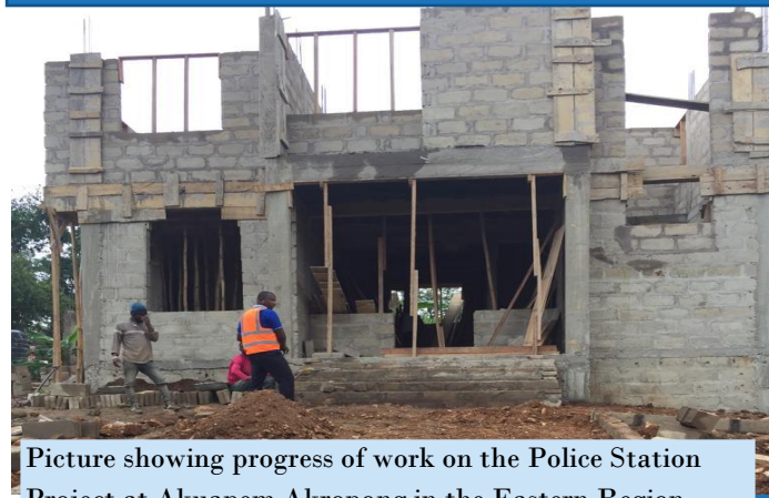
Picture showing progress of work on the Police Station Project at Akuapem Akropong in the Eastern Region